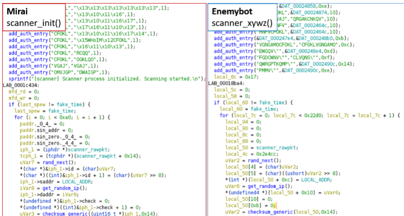
Figure 2: Obvious code similarities between Mirai and Enemybot’s scanner modules

In the case of Enemybot, although it is mainly based on Gafgyt, it was observed that some of its modules are clearly borrowed from Mirai’s source code. One of these is Enemybot’s scanner module as shown in the screenshots below.