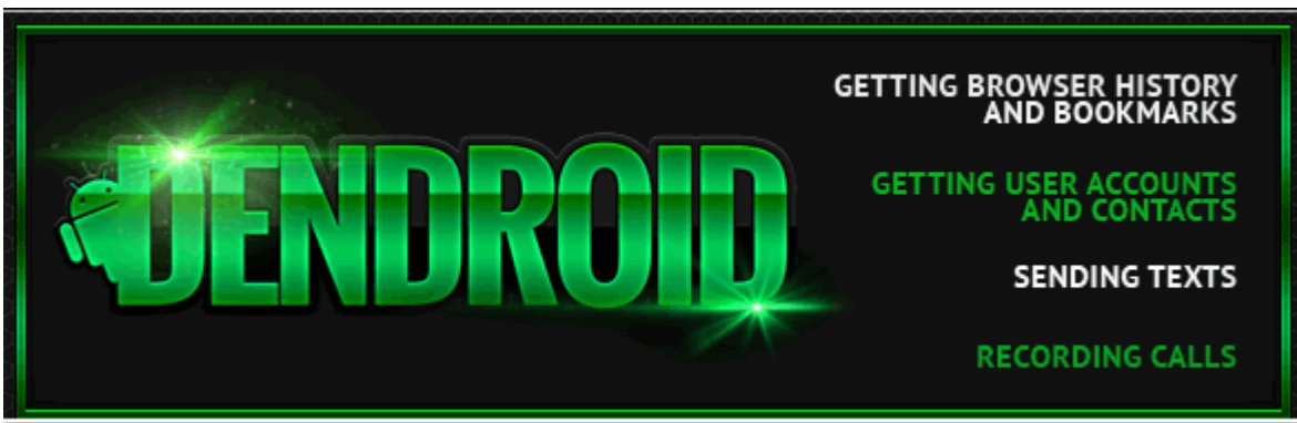
Figure 1. Dendroid advertisement banner

Darwinism is partly based on the ability for change that increases an individual's ability to compete and survive. Malware authors are not much different and need to adapt to survive in changing technological landscapes and marketplaces. In a previous blog , we highlighted a free Android remote administration tool (RAT) known as AndroRAT ( Android.Dandro ) and what was believed to be the first ever malware APK binder. Since then, we have seen imitations and evolutions of such threats in the threat landscape. One such threat that is making waves in underground forums is called Dendroid ( Android.Dendoroid ), which is also a word meaning something is tree-like or has a branching structure.