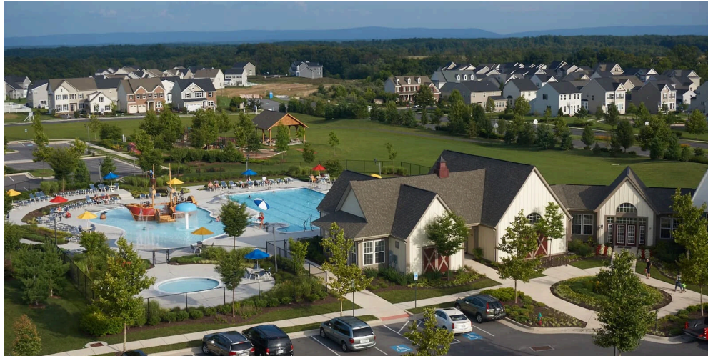
Brookfield Residential's Snowden Bridge

Published: 2020-08-25 · Archived: 2026-04-05 13:30:24 UTC