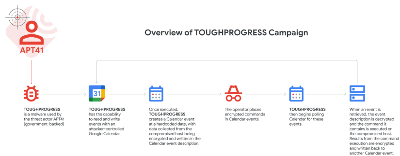
Figure 1: TOUGHPROGRESS campaign overview

In this blog post we analyze the malware delivery methods, technical details of the malware attack chain, discuss other recent APT41 activities, and share indicators of compromise (IOCs) to help security practitioners defend against similar attacks. We also detail how GTIG disrupted this campaign using custom detection signatures, shutting down attacker-controlled infrastructure, and protections added to Safe Browsing.