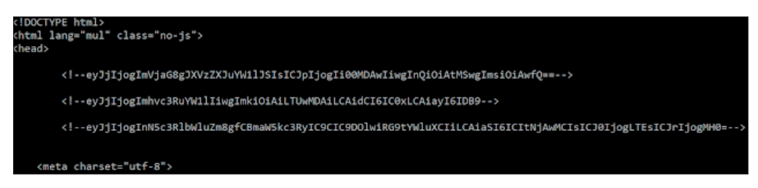
Figure 4: The source code of the fake page includes the commands.

In this example, the commands are encoded with a standard Base64 algorithm because we did not receive a custom dictionary. Figure 5 shows another example with a custom dictionary in the configuration file.