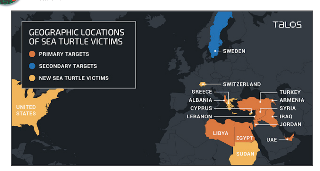
Figure 9: July 2019 victimology map.