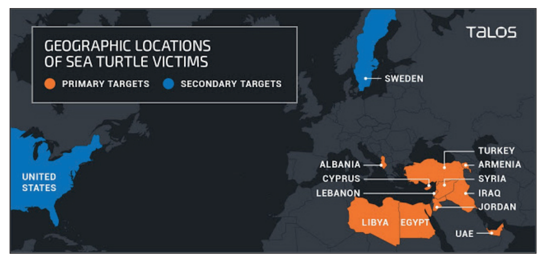
Figure 8: April 2019 victimology map.

Talos identified various victims of this campaign in the intelligence, military and government fields. These are not the types of victims typically associated with financially motivated attacks. We identified primary and secondary targets and split the victims distinctly. The first group, that we identify as primary victims, includes national security organizations, ministries of foreign affairs, and prominent energy organizations. The threat actor also targeted third-party entities that provide services to these primary victims in order to obtain access to them. Targets that fall into the secondary victim category include numerous DNS registrars, telecommunication companies, and Internet service providers. One of the most notable aspects of this campaign was how the attackers were able to perform DNS hijacking on their primary victims by first targeting these third-party entities.