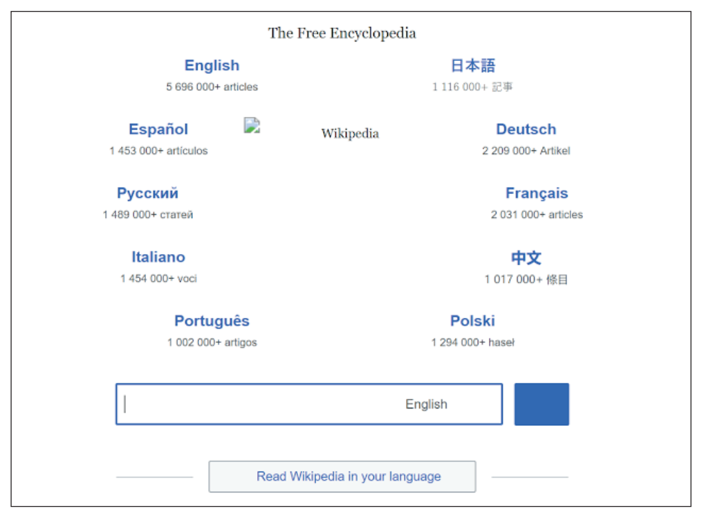
Figure 3: A fake Wikipedia page.

The commands are included in the source code of the fake page, as shown in Figure 4.