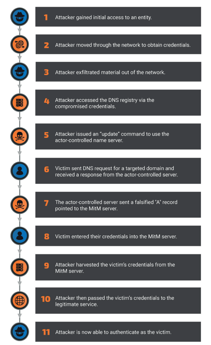
Figure 10: How we believe the actors behind the Sea Turtle campaign used DNS hijacking to achieve their end goals.