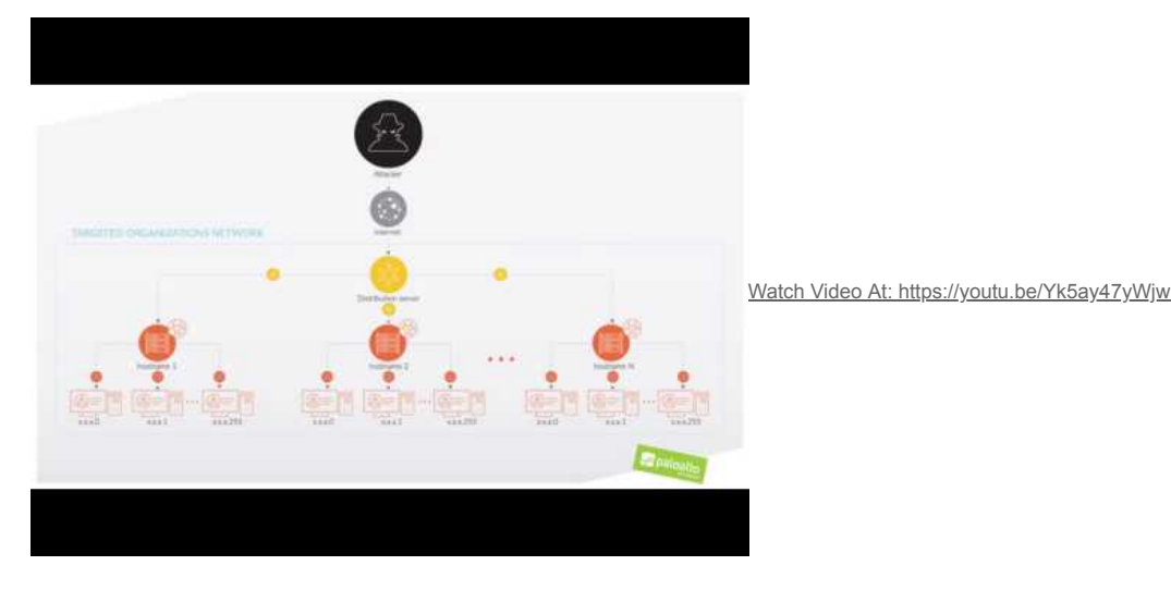
Figure 1 High-level view of Disttrack deployment in Shamoon 2 attack

From gathering files associated in the <u>third wave of Shamoon 2 attacks</u>, we found a Zip archive that contains files which the attacker used to infect other systems on the targeted network from a single compromised system they then use as a Disttrack distribution server. The actor deploys the Zip archive to this distribution server by logging in to the compromised system using Remote Desktop Protocol (RDP) with stolen, legitimate credentials and downloading the Zip from a remote server. The actor uses this single compromised system to distribute Disttrack to other systems in different parts of the network, where the Disttrack Trojan would attempt to spread to 256 other systems on each local network. The chart in Figure 1 visualizes the delivery of Disttrack at a high level.