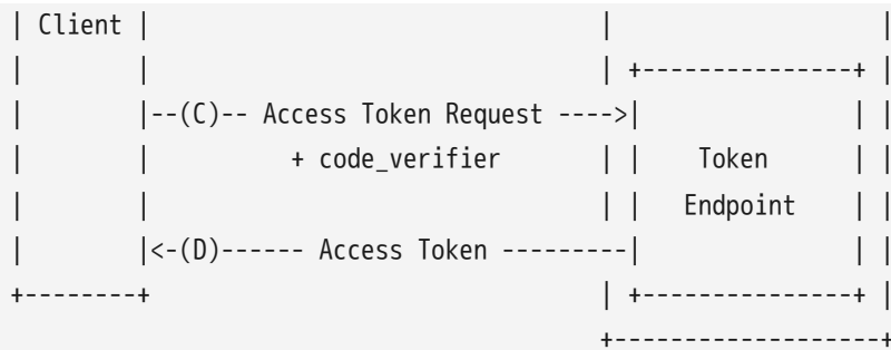
Figure 2: Abstract Protocol Flow

This specification adds additional parameters to the OAuth 2.0 Authorization and Access Token Requests, shown in abstract form in Figure 2.