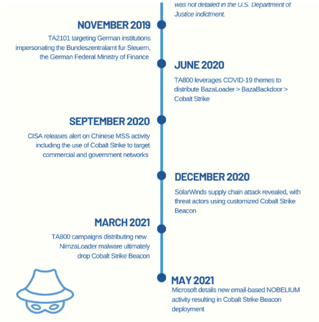
Figure 2: Timeline of threats using Cobalt Strike. Links to the sources are available in the References section.