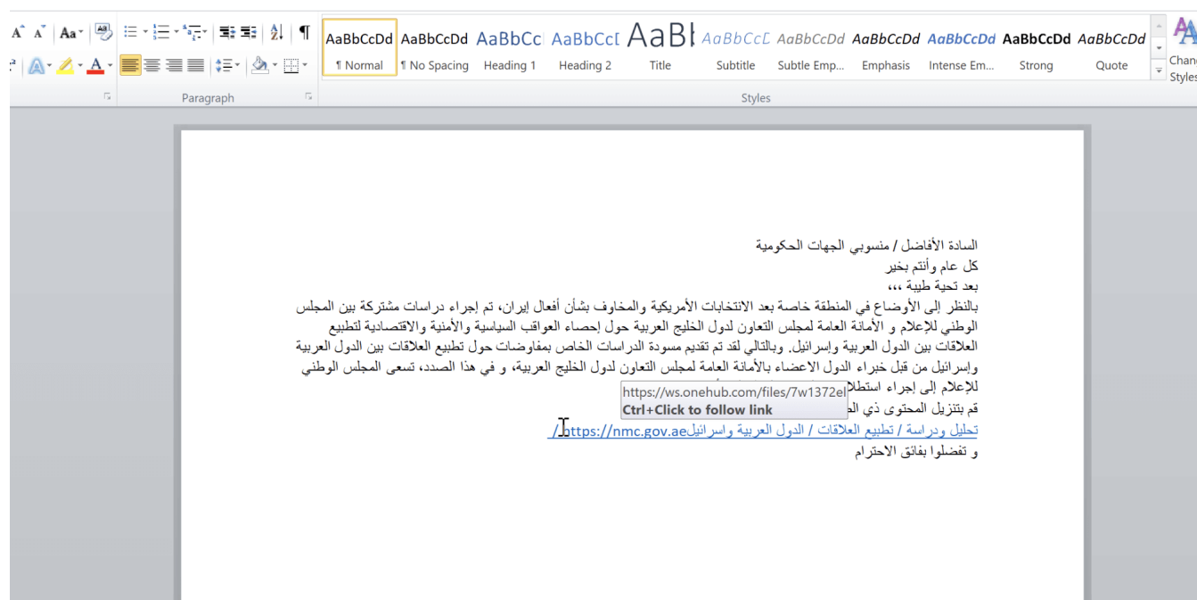
Figure 2 – Static Kitten Lure Document .docx

Static Kitten is distributing at least two URLs that deliver two different ZIP files that are themed to be relevant to government agency employees. The URLs are distributed through phishing emails with lure and decoy documents. An example lure is shown in Figure 2 below.