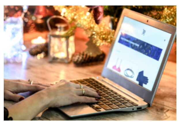
'Tis the Season for Scams