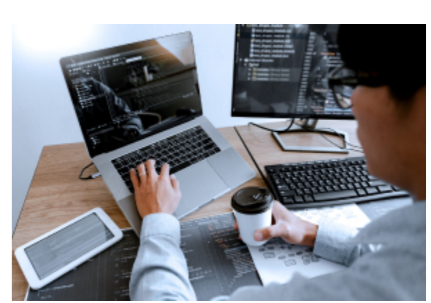
Emotet's Uncommon Approach of Masking IP Addresses