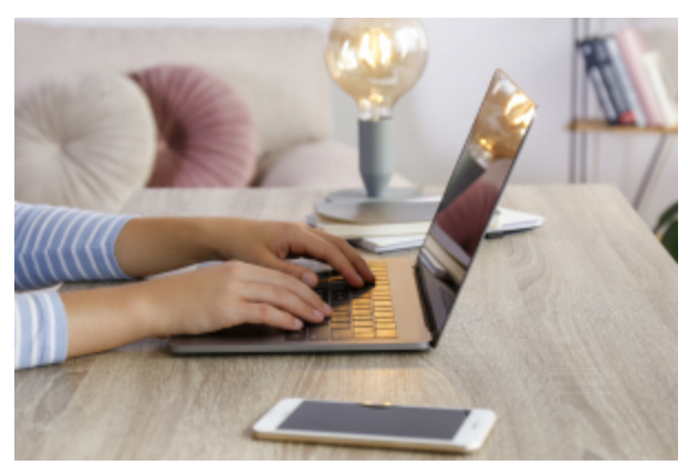
HANCITOR DOC drops via CLIPBOARD