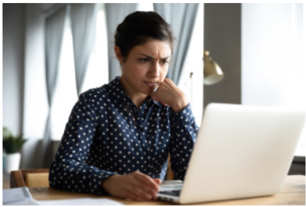
Malicious PowerPoint Documents on the Rise