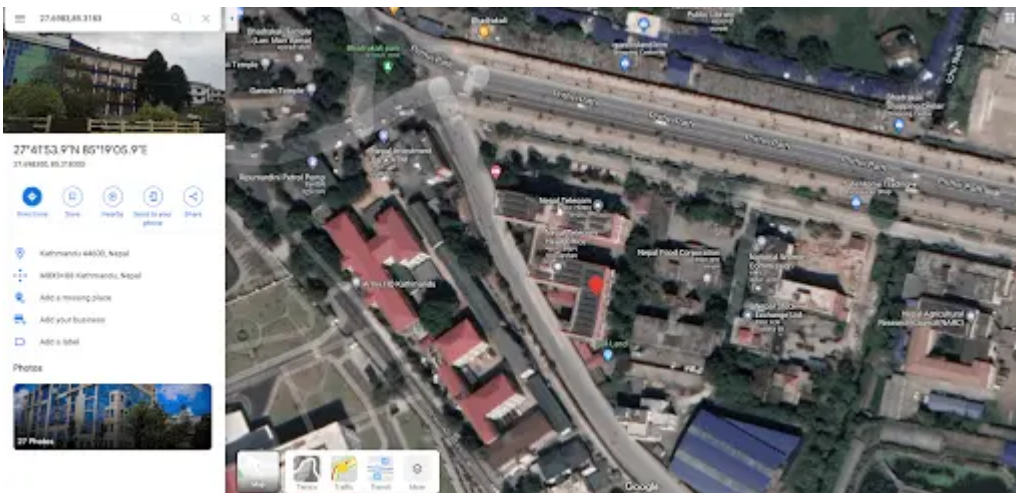
Figure 5: VPN and Geographical Information extension for Nepal Telecom IP 202.70.66[.]146

By clicking on the Google Maps view within the VPN and Geographical Information extension for this IP address, we can pinpoint a location and confirm that Nepal Telecom is likely the victim of this activity — the location directly points to Nepal Telecom’s head office in Kathmandu.