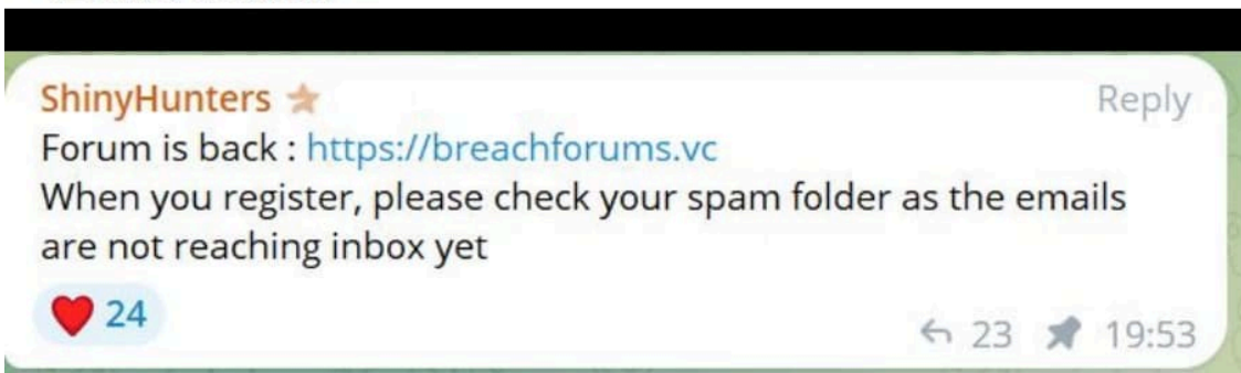
Baphomet's PGP-Signed message and ShinyHunters on Telegram (Hackread.com)

BreachForums, in its previous incarnation, served as a notorious hub for cybercriminals to exchange stolen data, discuss hacking techniques, and orchestrate illicit activities. The return of the forum, now under the auspices of ShinyHunters, has sent shockwaves through the cybersecurity community.