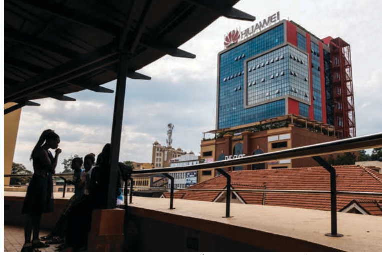
Figure 4: Huawei headquarters in Kampala, Uganda

In 2018, Uganda's President Yoweri Museveni ordered his cyber-surveillance intelligence unit to intercept encrypted online communications and cell phone calls of a "popstar turned political opponent" named Bobi Wine. According to an investigation by the Wall Street Journal, when the regime's intelligence agents tried for days to hack Wine's WhatsApp and Skype accounts and failed, they requested assistance from Huawei, the top digital supplier in Uganda. Within 2 days, the Huawei engineers were allegedly able to successfully breach Wine's WhatsApp account using spyware. Museveni's regime then used the access to sabotage the opponent's political rallies and arrest Wine and hundreds of his supporters.