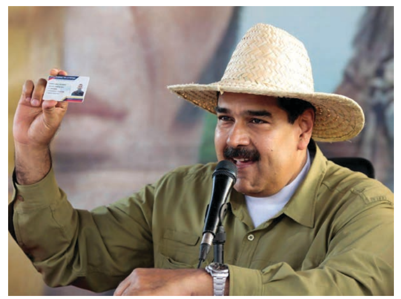
Figure 5: Venezuelan president Nicolas Maduro holding a fatherland ID card

In 2017, with the Maduro regime in power, Venezuela contracted with ZTE on a $70 million government effort to build a national ID card, payment system, and "fatherland database" to In March 2018, the government of Zimbabwe agreed to track individuals' transactions, personal information, and social