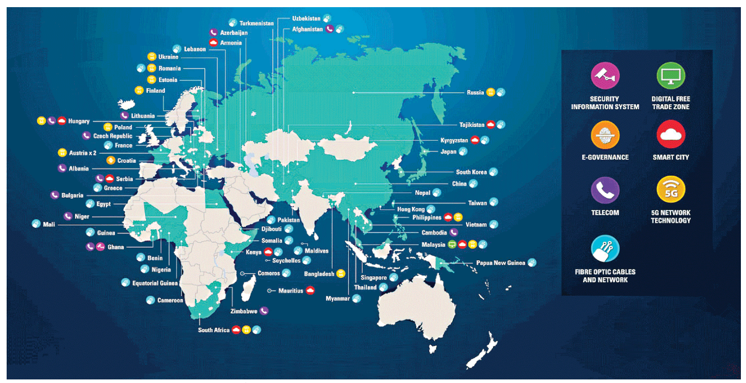
Figure 1: DSR IT infrastructure projects as of December 2018

It encompasses the digitizing of indigenous data without fully informed consent, the theft or exploitation of data, and the use has been one of the fastest growing economies, a pace that the of digital tools for influence and power over a subject.