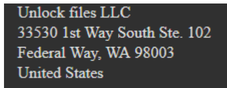
Figure 5 - Unlock files LLC address

Whoever's behind this PSCrypt campaign also shows sign of humour, indicating an address in the US, pointing to a company called "Unlock files LLC". Such company does not exist: