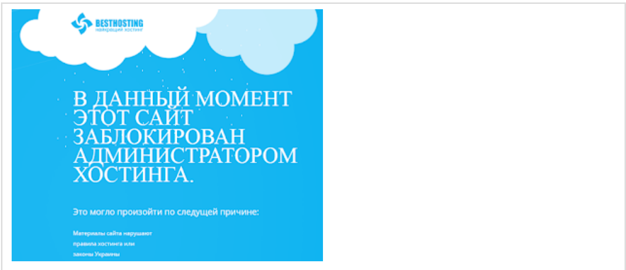
Figure 1 - "At this moment the site is blocked by the hosting administrator"

Crystal Finance Millennium' website is currently taken offline by the hosting provider, but archives of the website exist online.