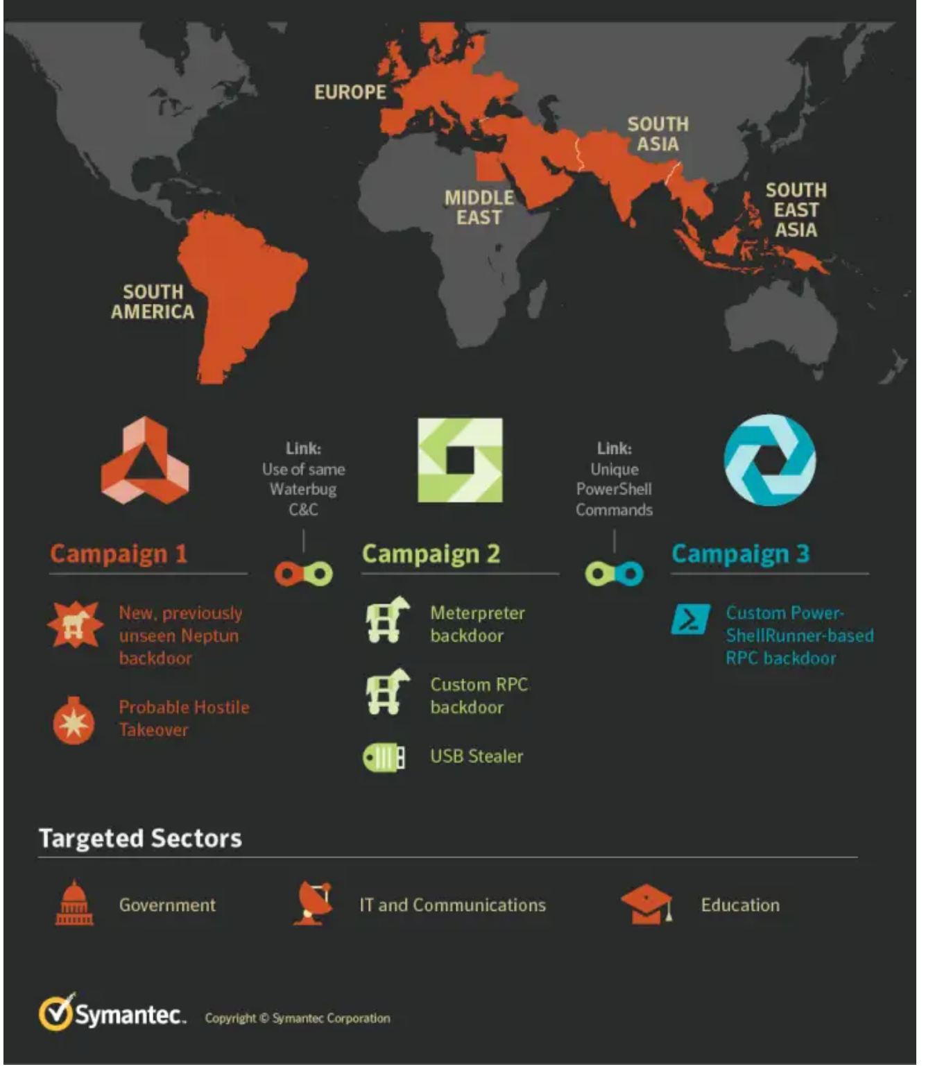
Figure 1. Waterbug group rolls out fresh toolset in three new campaigns