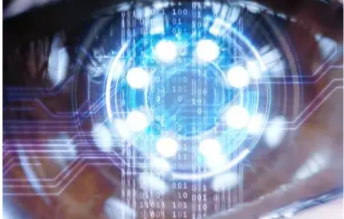
Threat Intelligence5 Min Read

BroadcomSymantec Enterprise Blogs You might also enjoy