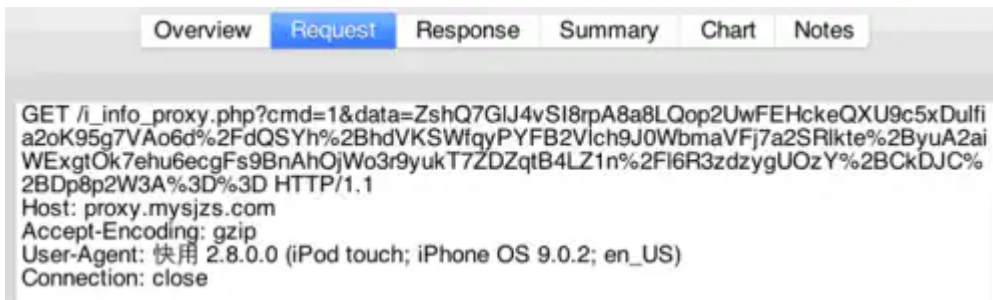
Figure 17 Encrypted Apple ID and password was sent to a server