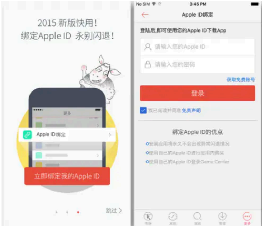
Figure 15 Kuaiyong.ipa asks user to input Apple ID and password