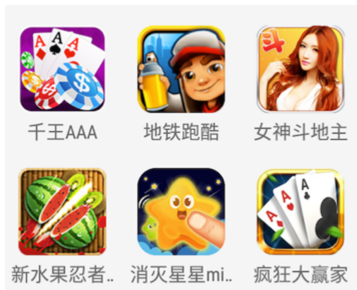
Figure 3 Apps installed on the Android device by DualToy

Figure 3 shows the apps downloaded and installed by DualToy. They’re all games which use Chinese as the default language, and none of them are available in the official Google Play store.