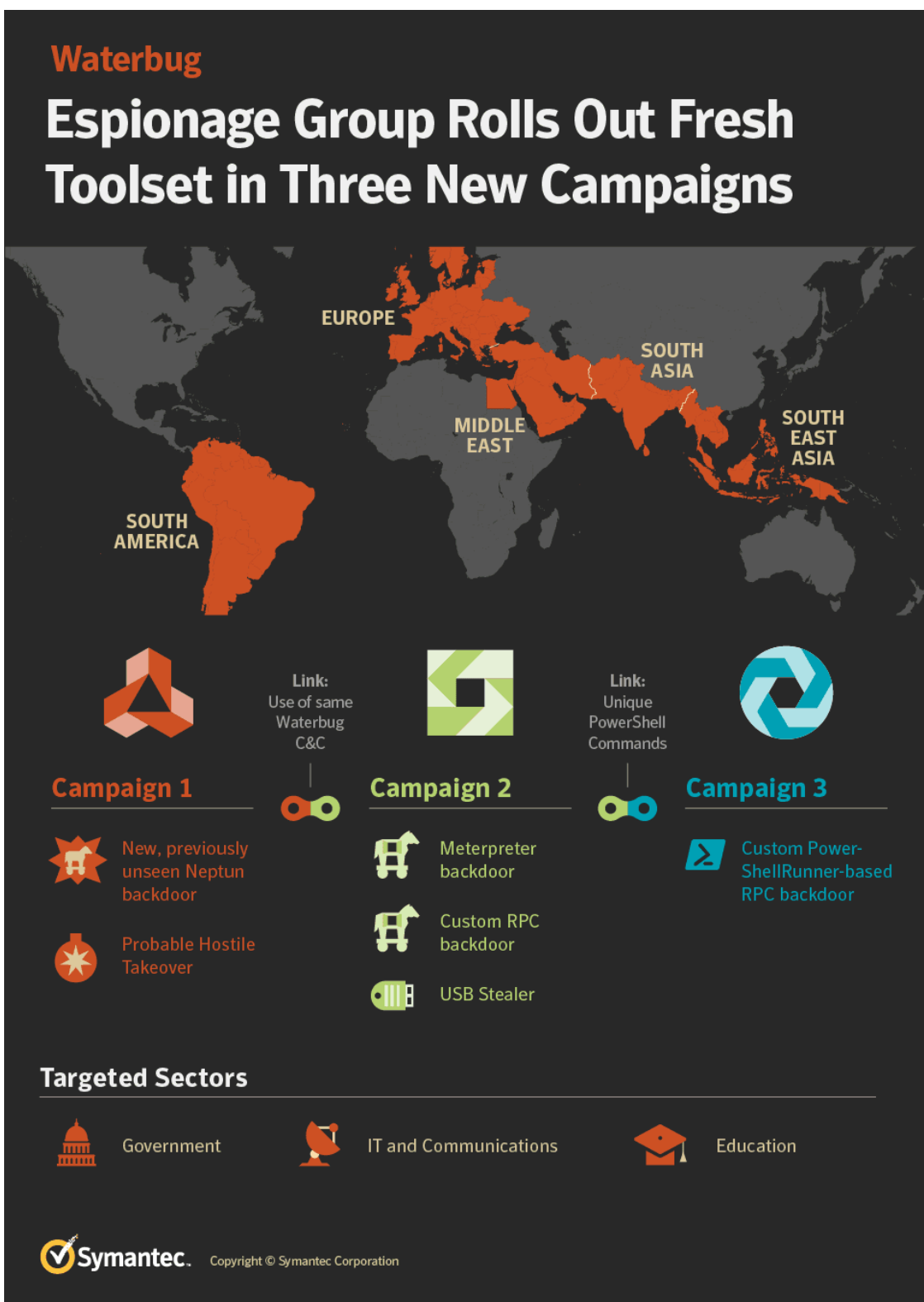
Figure 1. Waterbug group rolls out fresh toolset in three new campaigns