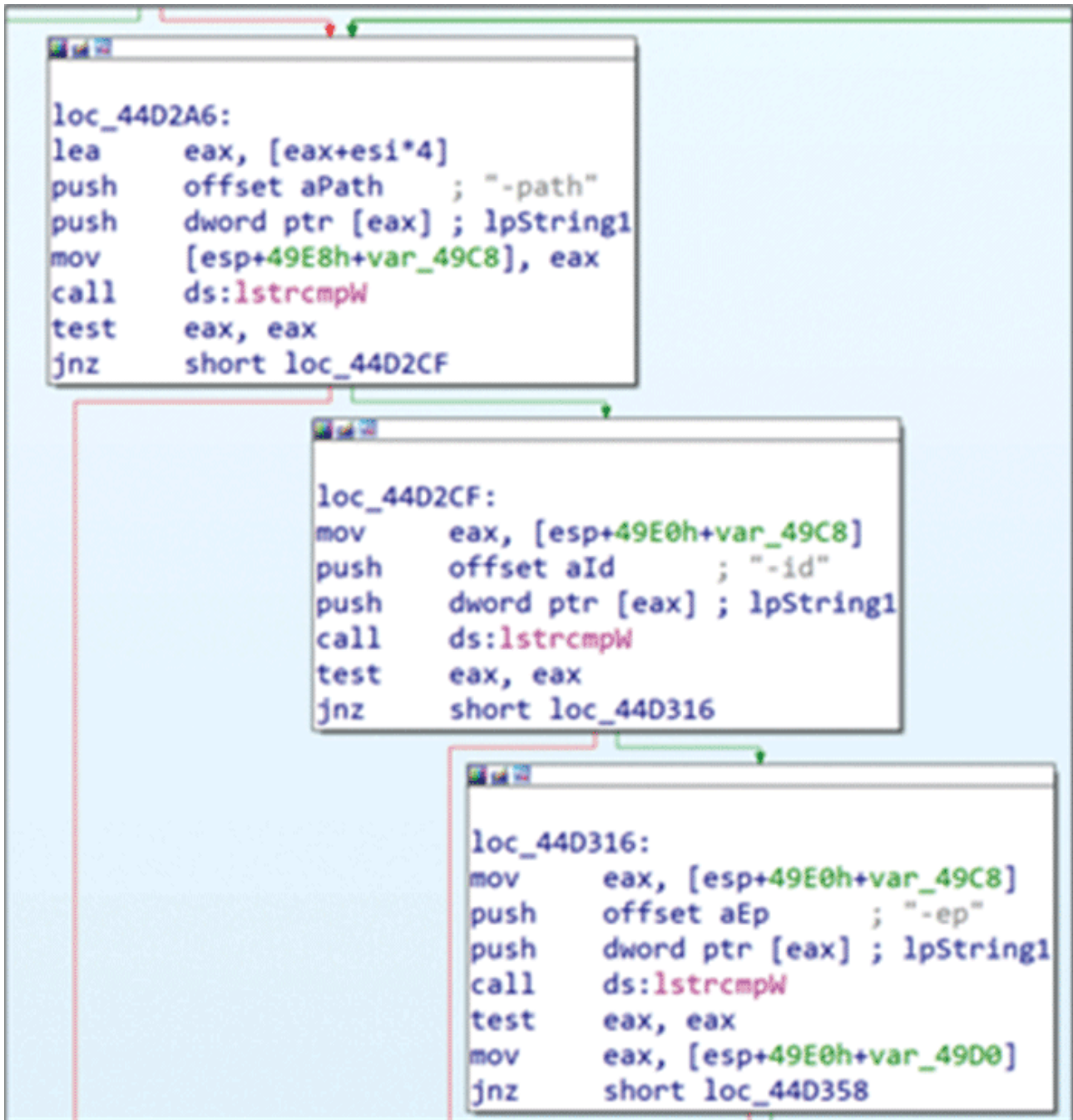
Figure 7 - Ransomware Configuration Detailing Command Arguments

After parsing the command line arguments, the ransomware deletes the Volume Shadow Copies to prevent restoration (Figure 8). It achieves this by creating a new vssadmin.exe process with the argument "delete shadows /all /quiet".