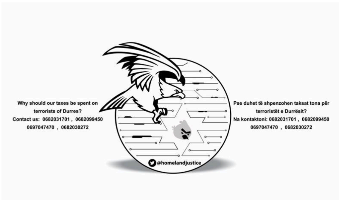
Figure 2: ROADSWEEP wallpaper and HomeLand Justice banner