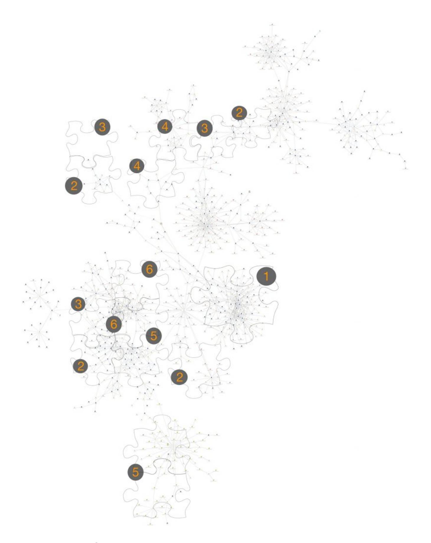
Figure 2. PKPLUG Maltego diagram highlighting published research