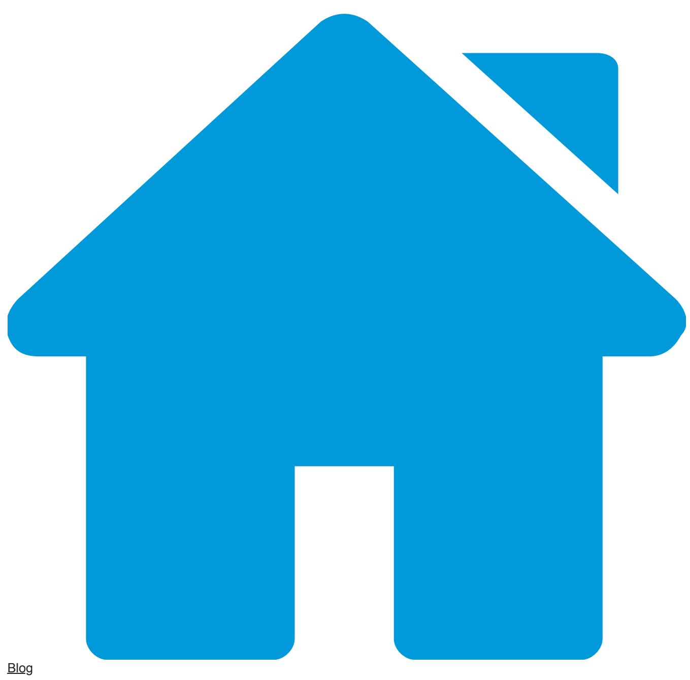
Blog Threat Insight NetTraveler APT Targets Russian, European Interests