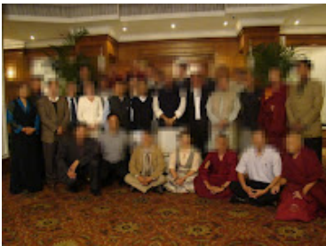
| | FileAgent <<<< MD5: 2D84BFBAE1F1B7AB0FC1CA9DD372D35E