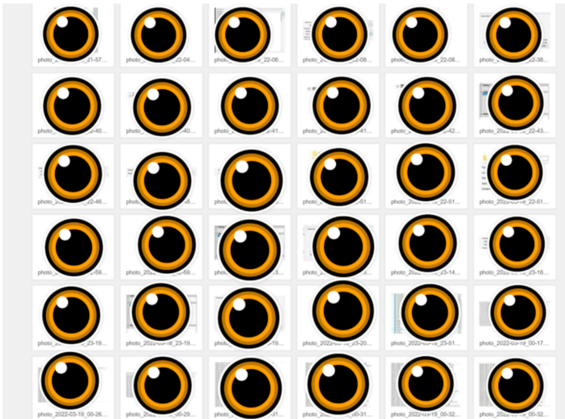
The threat actors showed a negotiator for ETCH numerous files that they had exfiltrated during negotiations. These are just some. Redacted by DataBreaches.net.

But “may have been copied or viewed?” ETCH had direct knowledge and proof as to some of what had happened, as they actually negotiated with the threat actors and were given multiple examples of proof. Then, too, some data were actually dumped and made freely available to the public.