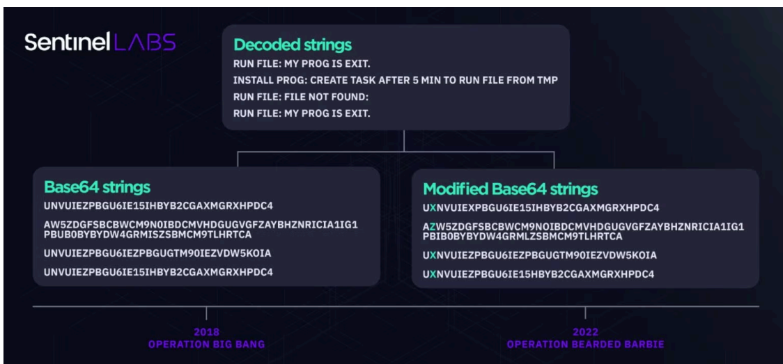
Backdoor string matches

The BarbWire samples used as part of Operation Bearded Barbie are reported to implement a custom base64 algorithm ( cit. ) to obfuscate strings. The backdoor does not implement changes to the Base64 encoding algorithm itself, but modifies Base64 strings by adding an extra character that is removed before decoding. String decoding of BarbWire strings in this way reveals exact matches between BarbWire and the backdoor observed in the Big Bang campaign.