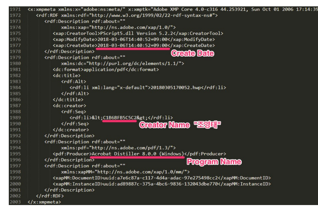
Figure 8. Metadata in the decoy file