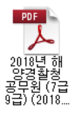
Figure 8. Malware disguised as PDF

While investigating other Bisonal samples we found another dropper submitted to an online malware database on March 6. The original file name was "2018년 해양경찰청 공무원 (7급 9급) (2018.03.05).pdf.exe". This translates to "2018 Korean Coast Guard Government Employee (Grade 7, Grade 9).pdf.exe" in English. Similar to the Bisonal variant targeting the Russian organization, this sample was also disguised as PDF document.