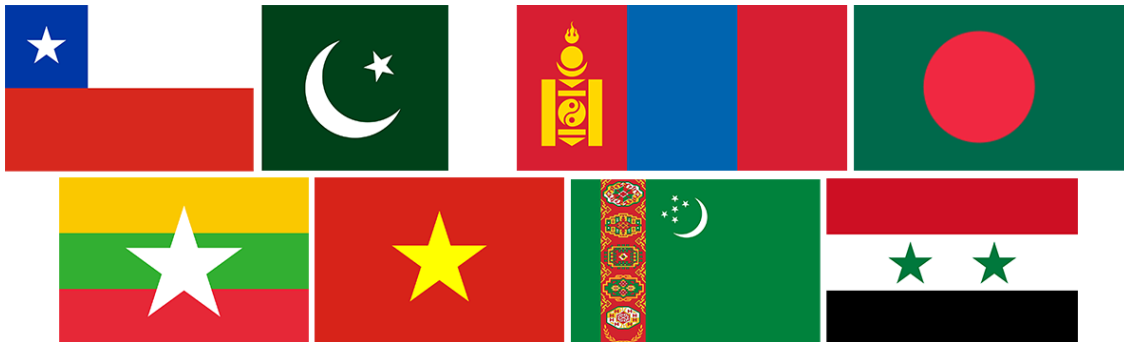
Countries that had ties to RCS Lab's past business connections. Top row: Chile, Pakistan, Mongolia and Bangladesh; bottom row: Myanmar, Vietnam, Turkmenistan and Syria.