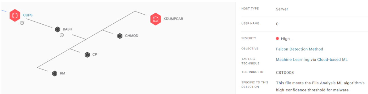
Figure 2. JustForFun implant detection (Click to enlarge)