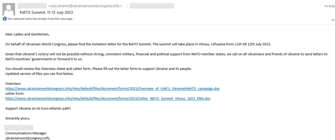
Figure 3. Storm-0978 email uses Ukrainian World Congress and NATO themes

Microsoft Defender for Office 365 detected Storm-0978’s initial use of the exploit targeting CVE-2023-36884 in this phishing activity. Additional recommendations specific to this vulnerability are detailed below.