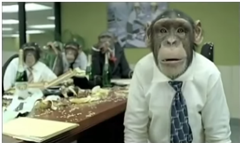
Figure 1. Cozyduke campaign used an "Office Monkeys†video as a lure–July 2014

The group began its current campaign as early as March 2014, when <u>Trojan.Cozer</u> (aka Cozyduke) was identified on the network of a private research institute in Washington, D.C. In the months that followed, the Duke group began to target victims with \hat{a} \in \infty Office Monkeys \hat{a} \in - and \hat{a} \in \infty Fax \hat{a} \in -themed emails, booby-trapped with a Cozyduke payload. These tactics were atypical of a cyberespionage group. It \hat{a} \in \mathbb{T}^{M} s quite likely these themes were deliberately chosen to act as a smokescreen, hiding the true intent of the adversary.